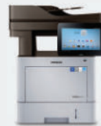
M4580FX (45 ppm)