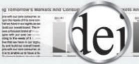
De-ICE (Integrated Cavity Effect)